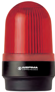
LED Permanent Beacon 211 (base mounting)