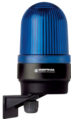
LED Permanent Beacon 214 with integrated mounting bracket