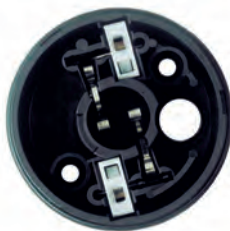
Housing with CAGE CLAMP® connection